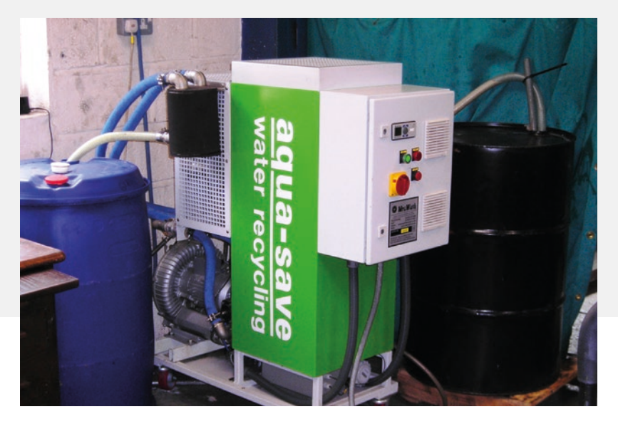
Aqua-Save Junior at Universal Engineering Company (Charlstown) Ltd